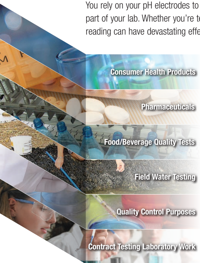
Consumer Health Products

It is critical that the electrochemical measurements you perform day-to-day are accurate and reproducible. You rely on your pH electrodes to measure your samples quickly and precisely, making them an essential part of your lab. Whether you're testing samples in pharmaceuticals, food or general lab work, one incorrect reading can have devastating effects. Why take chances with a low quality electrode?